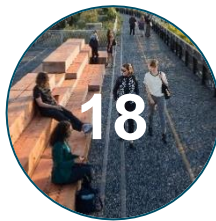
Seating and Benches