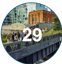
Sidewalk or Paths