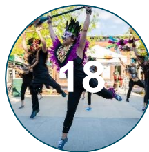
Arts, Culture, and Entertainment